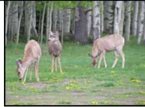
1820 SPRUCE ROAD $49,900