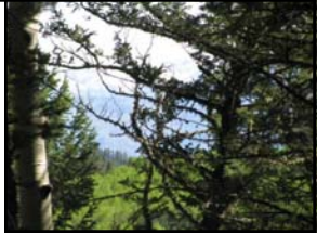
130 RIDGE ROAD $79,900