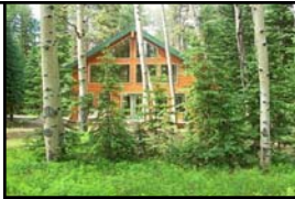
1070 SPRUCE ROAD SOLD!!!!