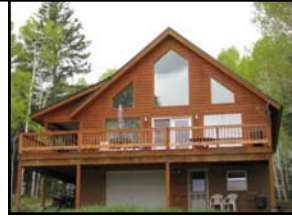
732 CREST DRIVE $369,900