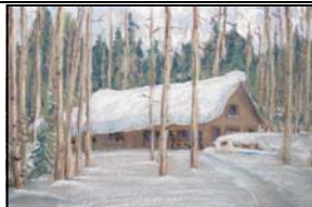
RENTAL CABIN AVAILABLE

a map and details today, I'd be happy to show you around!!