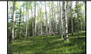
310 CREST DRIVE $42,000