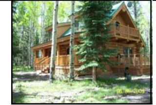
301 CREST DRIVE $319,900