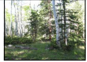
304 CREST DRIVE $56,000