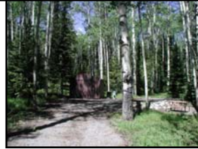
321 CREST DRIVE $79,900