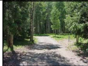
101 ASPEN DRIVE SOLD!!!!