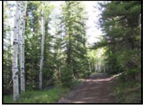
320 RIM ROAD $38,000