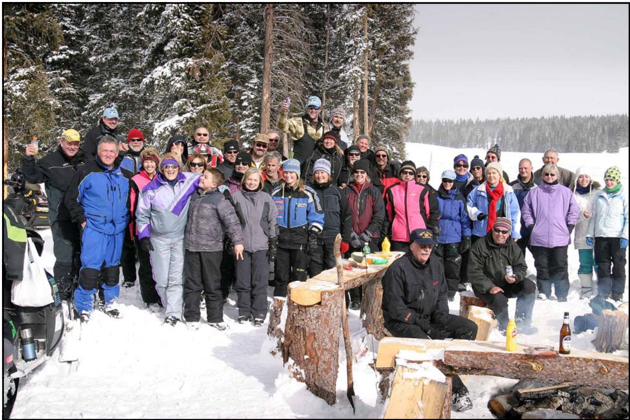
Arrowhead Snowmobile Club group ride to Willow Park January 23, 2010.

From: Arrowhead Improvements Association, Inc. P.O. Box 89 Montrose, CO 81402