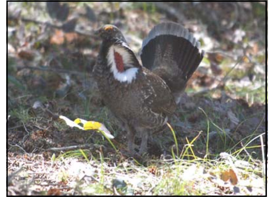
Grouse photo taken last Spring on Crest by Clyde Vavrik

The Fire Protection District is selling a 1996 Polaris XL. It is a wide track, two-up work horse sled with two forward gears and reverse. Asking $500. If interested, contact Kevin Stilley (862-8277) or Bob Rosenbaum (862-8241).