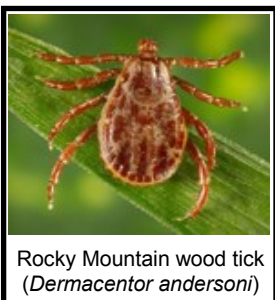
Rocky Mountain wood tick ( Dermacentor andersoni )

Ticks are more active from April to June. When out in the woods, wear protective clothing. Light colors allow you to see the tick. Wear long sleeves and long pants to discourage ticks. The tick is usually in low foliage and waiting for you to walk by. It usually takes a few hours for the tick to find skin to attach and up to 24 hours to transmit infection. Use repellants containing DEET carefully, especially on children. Insecticides, containing permethrin, should be used on clothing only. Conduct regular check for ticks while in the woods and complete body check when returning home.