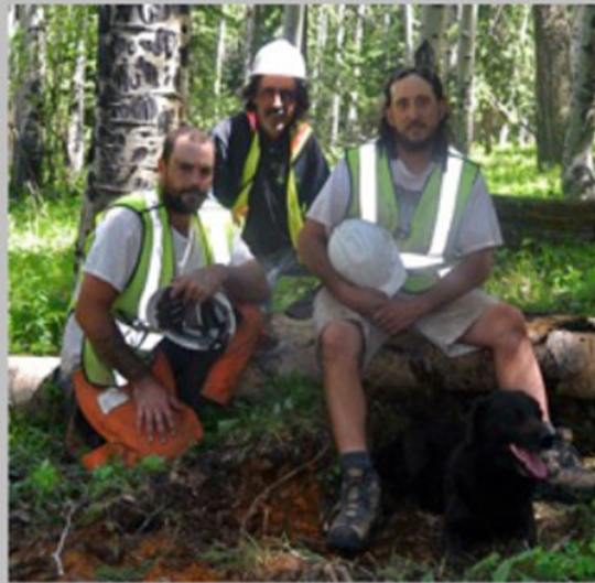
Mitigation & Lot Clearing